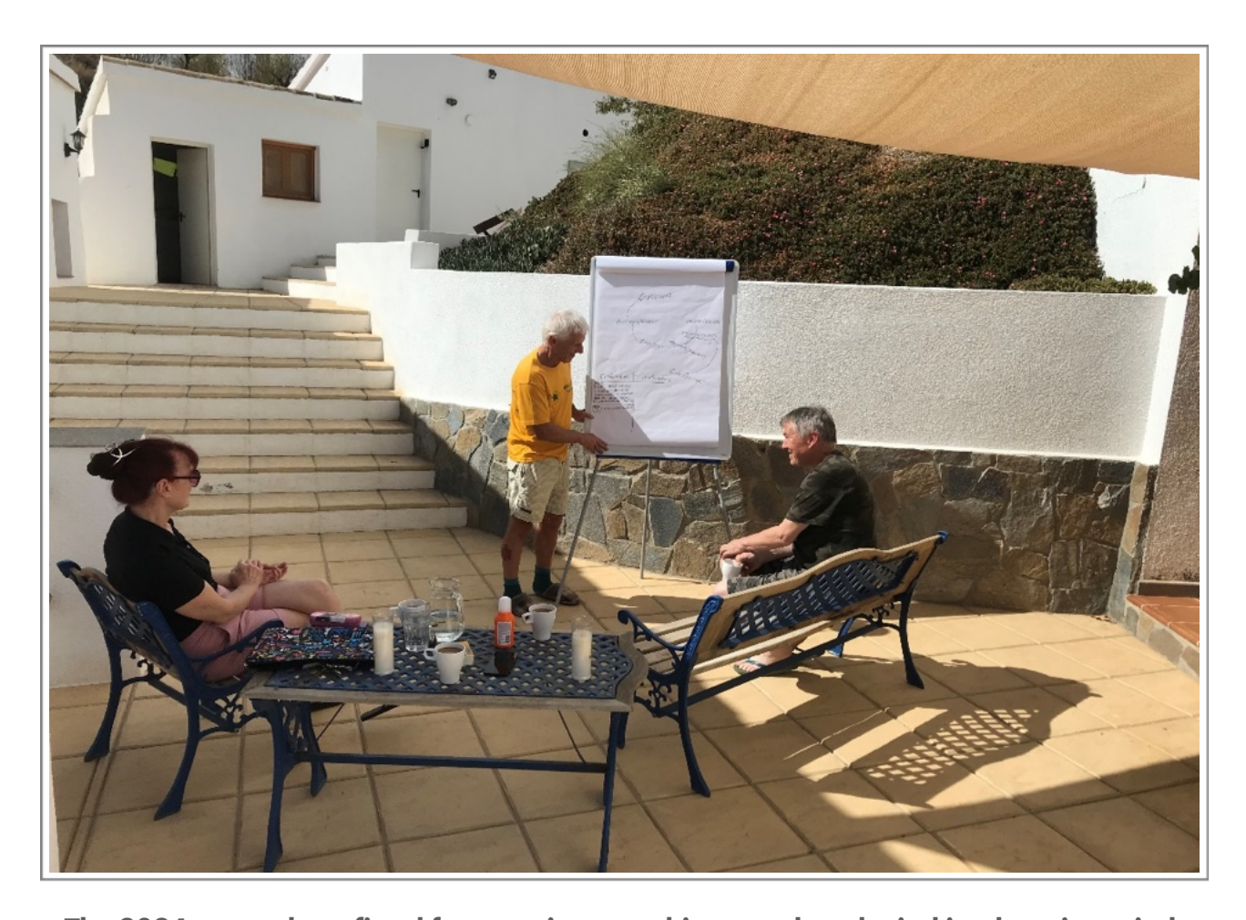
The 2024 retreat benefitted from copious sunshine - a relaxed mind is a learning mind.